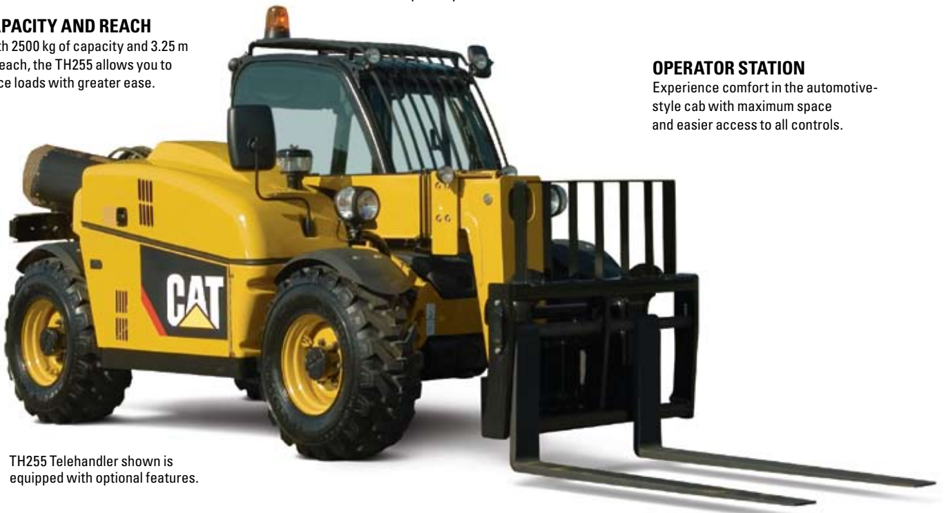
TH255 Telehandler shown is equipped with optional features.

Experience comfort in the automotive-style cab with maximum space and easier access to all controls.